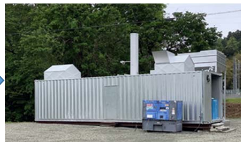
Gasification Plant AMATERAS