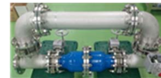
Hydro Energy α